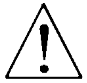
The lamp is high hot!